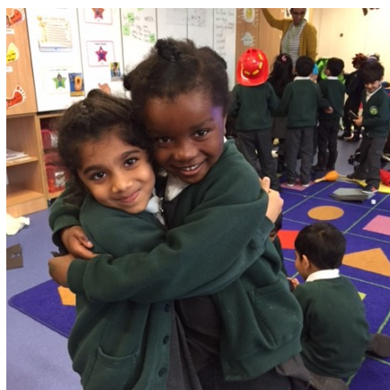
Earlham Loves Everybody Day! The children were even more kind and caring than usual!