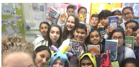
World Book Day 2018!